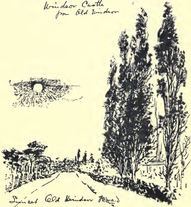
Sweet Old Windsor Road